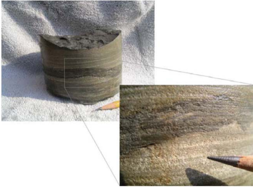
Fig. 2—Thin lamination in core.

production increase was 35 Mcf/D. Average well life was extended more than 5 years, and most paid out in less than 12 months.